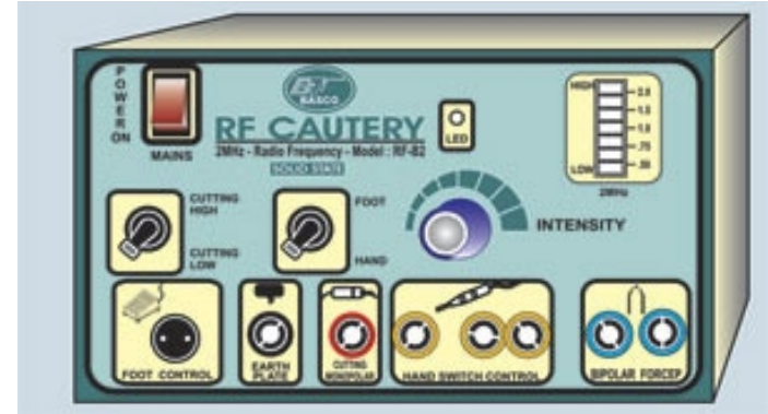
RF CAUTERY - 2MHz Radio Surgery with High Frequency